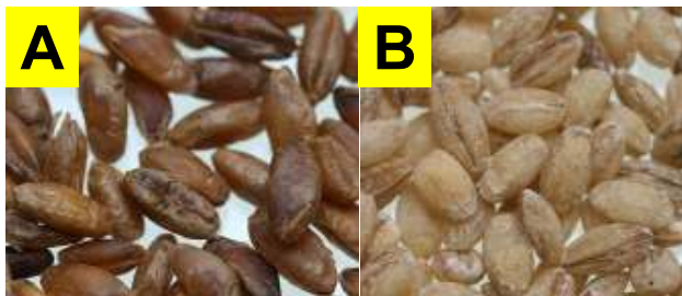
Fig. 1. Initial appearance of (A) AF-36 and (B) Afla-Guard®.

AF-36 and Afla-Guard® are commercial preparations of different strains of the fungus, Aspergillus flavus . Neither of these strains produce aflatoxin; thus, they are referred to as “atoxicogenic” strains. AF-36 is heat-killed wheat seed which is colonized by the fungus, but its growth is not visible (Fig. 1A). It is labeled in Texas for aflatoxin control on corn and cotton and is produced by Arizona Cotton Research and Protection Council, with Double CT LLC (Scott Averhoff (972) 351-1439 or Arleen Averhoff (972) 351-4825) as the Texas distributor. Afla-Guard® consists of hulled barley seed coated with spores of the fungus (Fig. 1B). It is labeled in Texas for aflatoxin control on corn (field, sweet, and popcorn) and peanuts. It is produced by Syngenta Crop Protection, Inc. and is available from dealers that sell their products.